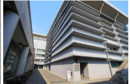
■ Wakayama Big-Wave