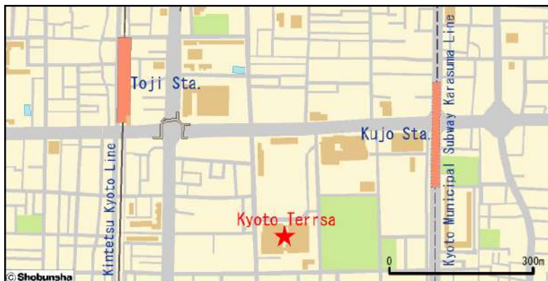
■ Kyoto Terra