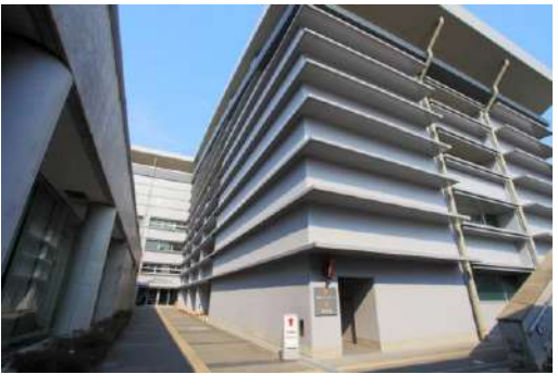
■ Wakayama Big-Wave