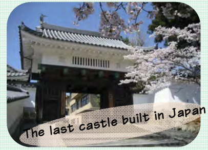
Sonobe Castle ruins