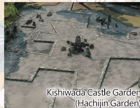
Kishiwada Castle Garden (Hachijin Garden)

Facing the sea and surrounded by mountains, this city is full of seasonal attractions. Additionally, highways have been maintained since the Edo period, and we still have a high traffic convenience.