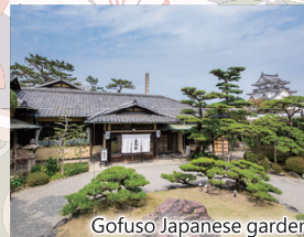
Gofuso Japanese garden