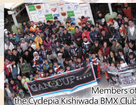
Members of the Cyclepia Kishiwada BMX Club

Citizens and many volunteers including those who love BMX and bicycles, those who are passionate about the tournament will come together and help you out. We will work all together for the tournament, share the excitement of sports and support you with heart.