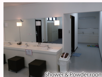
Shower & Powder room